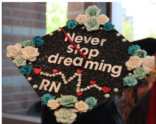
Rutgers School of Nursing Graduation 2016

You may also submit a Student Aid Report (SAR) if you wish financial need to be considered when your application is scored.