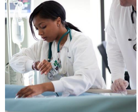
College of DuPage/Flickr 2013

To submit an NISF application, you must first have a KBN nurse portal account. You do not have to be a nurse to create an account. You must have a valid email address that you are able to access. To create your nurse portal account, go to the KBN Nurse Portal and click the blue Create an Account button. Follow the prompts for creating an account and you will receive an email with an activation link. Click on the activation link to finish the account creation process. More instructions on creating a nurse portal account, including an instructional video, can be found on the Nurse Portal Instructions page.