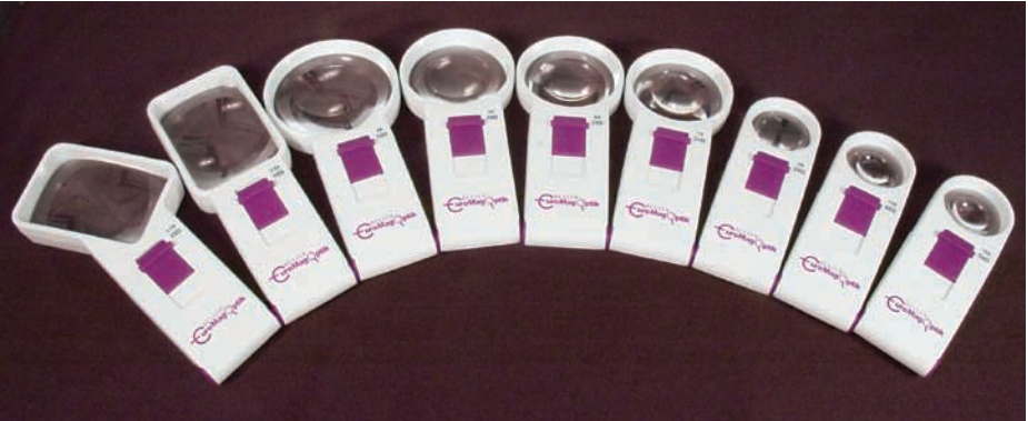
Magnifiers match item numbers from left to right

PREMIUM OPTICS, NO GLARE ILLUMINATION, AFFORDABLE PRICE