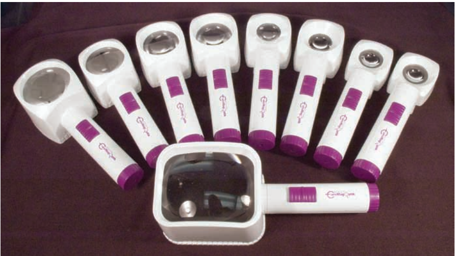
Magnifiers match item numbers from left to right