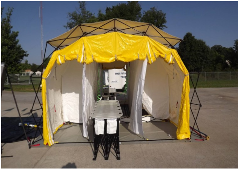
Mobile Decontamination Unit